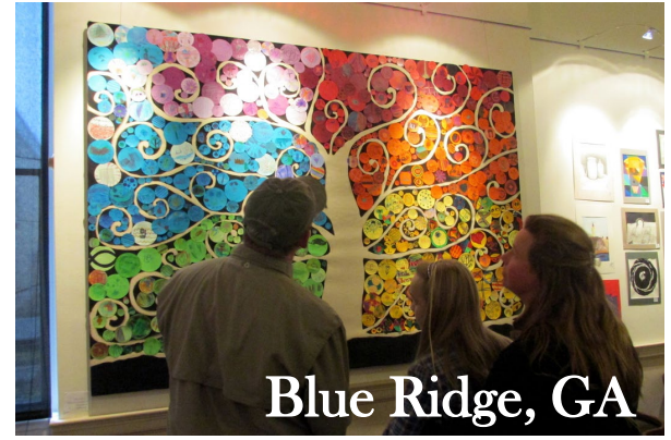
Blue Ridge, GA